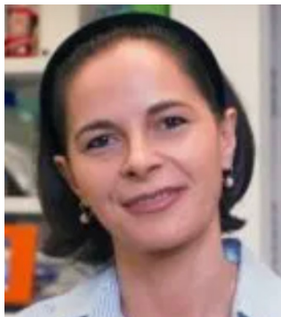
COMMITTEE MEMBER: YASMINE BELKAID NATIONAL INSTITUTE OF ALLERGY AND INFECTIOUS DISEASES (NIAID)